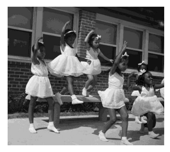
Hosted by The Historical Society of Washington, D.C. In the Carnegie Library, 801 K Street, NW